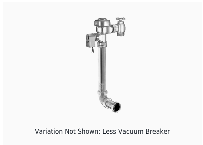
Variation Not Shown: Less Vacuum Breaker